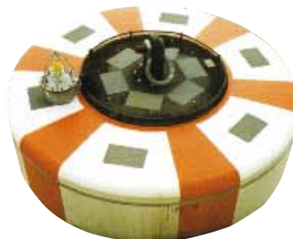
Mooring Buoy Complete with Beacon